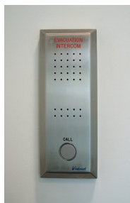
Windcrest refuge and lift communications intercom