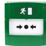
Green emergency door release