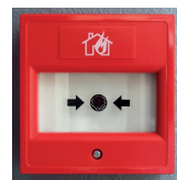
Fire alarm call point