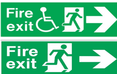
Fire exit sign and wheelchair-friendly fire exit route sign