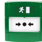
Green emergency door release.