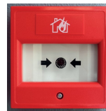
Fire alarm call point