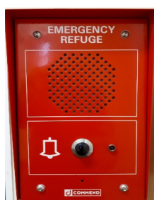
Commend refuge communications intercom