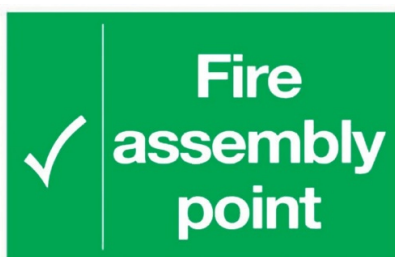
Fire assembly point sign