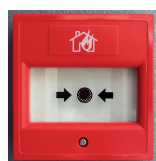
Fire alarm call point