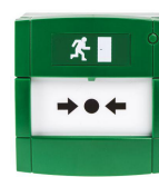
Green emergency door release button