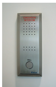
Windcrest refuge and lift communications intercom