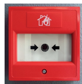
Fire alarm call point