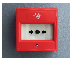
Fire alarm call point