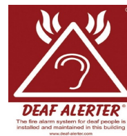
Deaf Alerter sign