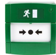
Green emergency door release