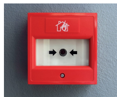
Fire alarm call point