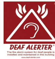
Deaf Alerter sign