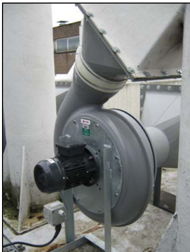
Replacement centrifugal fan systems with energy efficient motors installed on the roof.