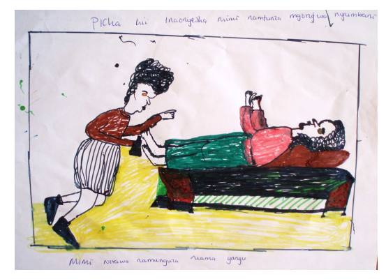
Figure 1: "This picture shows me caring for my mum when she was ill', drawing by Neema (aged 18) who cares for her mother with HIV and three younger siblings.