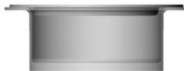
Figure 2. Tzero Pan with hermetic lid.